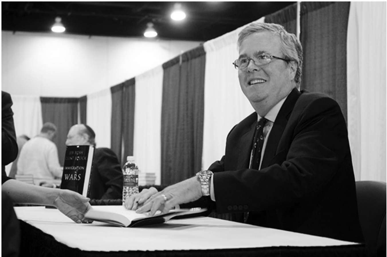
Former Florida Gov. Jeb Bush, a GOP candidate for the 2016 presidential nomination, signs copies of his book in 2013.

The assumption I characterize above as “debatable” is that only a comprehensive mega-bill addressing all the major immigration issues will work. That is a position that many pragmatic, fair-minded persons hold: either the usual cynical, non-transparent horse trading must be allowed or nothing will happen. On the other hand, the electorate has seen vividly how unsatisfactory the results were with the comprehensive immigration legislation bills of 2006, 2007, and 2013. The electorate has close to zero confidence in the U.S. Congress